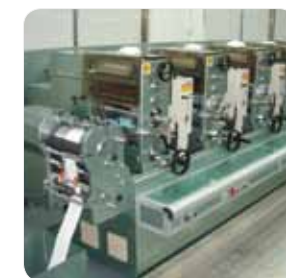
Paper making equipment